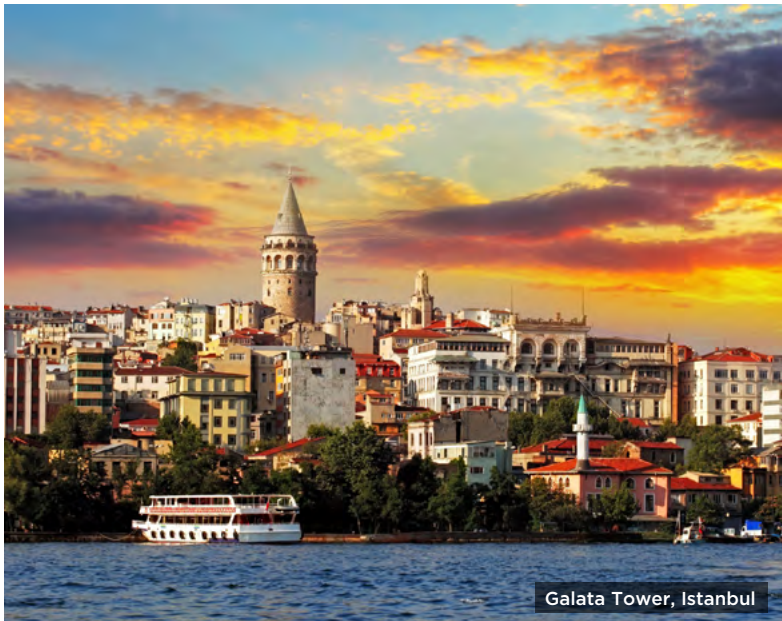
Galata Tower, Istanbul