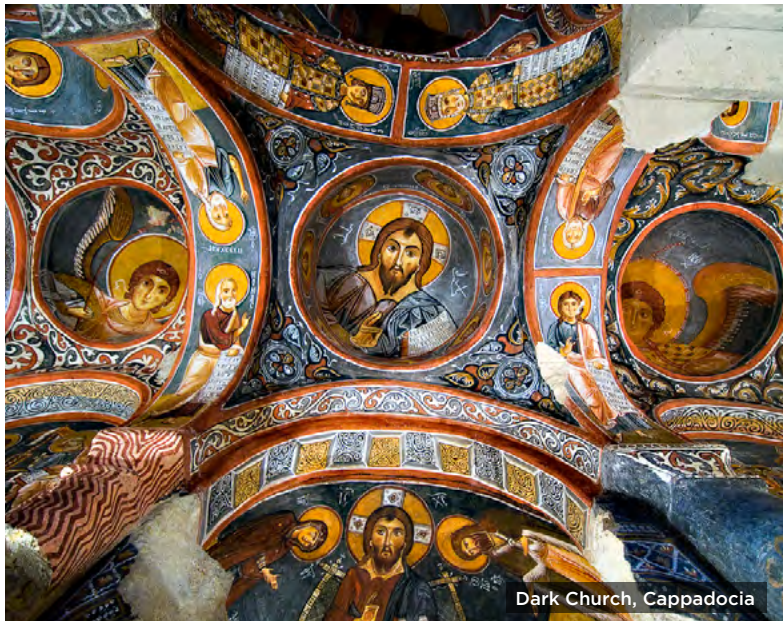
Dark Church, Cappadocia