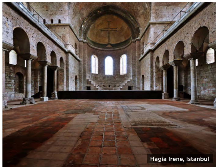
Hagia Irene, Istanbul