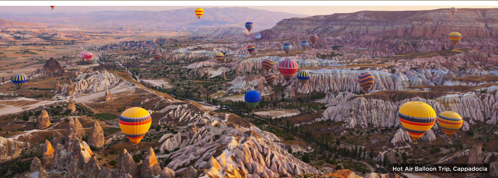
Hot Air Balloon Trip, Cappadocia